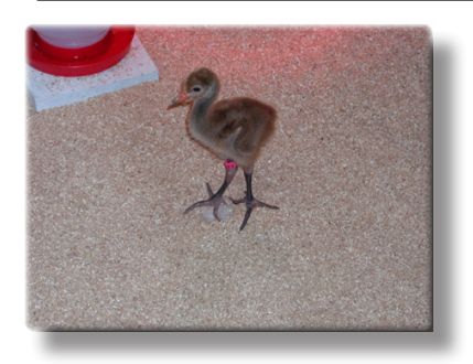
Research will focus on development of knowledge and technologies to promote the production of healthy whooping crane chicks, such as this one at the USGS Patuxent whooping crane breeding facility.