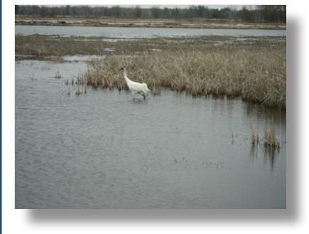
The reintroduced Eastern Migratory Population, an adult member of which is seen here, breeds on and around Necedah National Wildlife Refuge, in central Wisconsin.